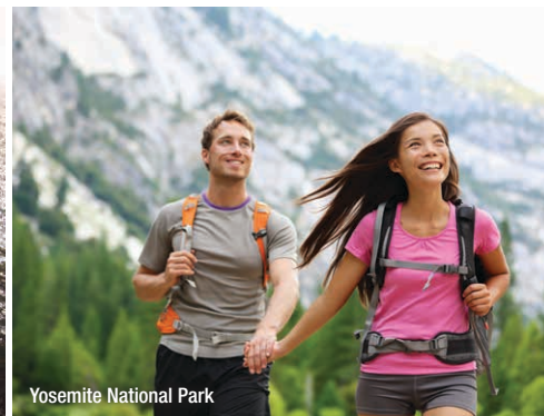
Yosemite National Park